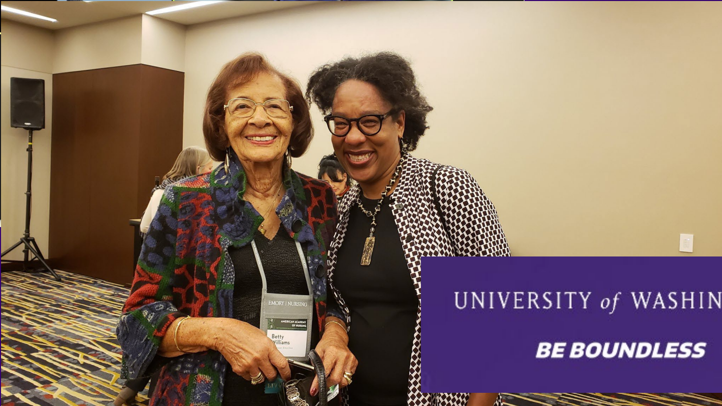
Agenda for tomorrow