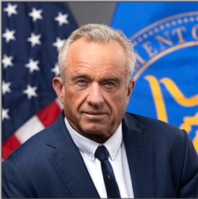
Robert F. Kennedy, Jr. HHS Secretary