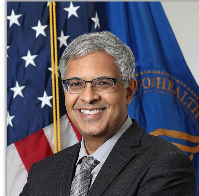
Jay Bhattacharya, M.D., Ph.D. NIH Director