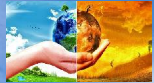
Climate Change and Health Initiative